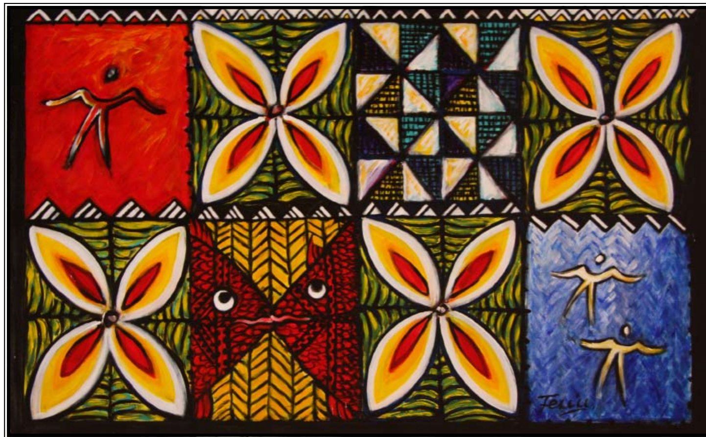
Leiloa II – Includes the symbols of Ancestral spirits and the Frangipani. The frangipani is influenced by the generalized flower form seen in Samoan siapo cloth which is generally made by female makers. For this reason the frangipani flower comes to represent the female form.