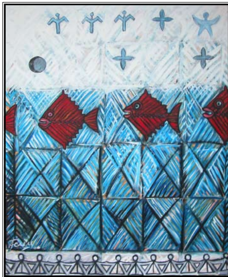
Red Fish - 2006 The red tuna and frigate bird that commonly feature in Feu'u's work are often representative of physical and spiritual journeys. © Fatu Feu'u

The following pages provide a detailed report card on our progress in 2010. While we strive always to get straight A's , we recognise there is always room for improvement. We continue to track our performance and draw on the key learning points to refine what we do and how we do it, and welcome feedback from others.