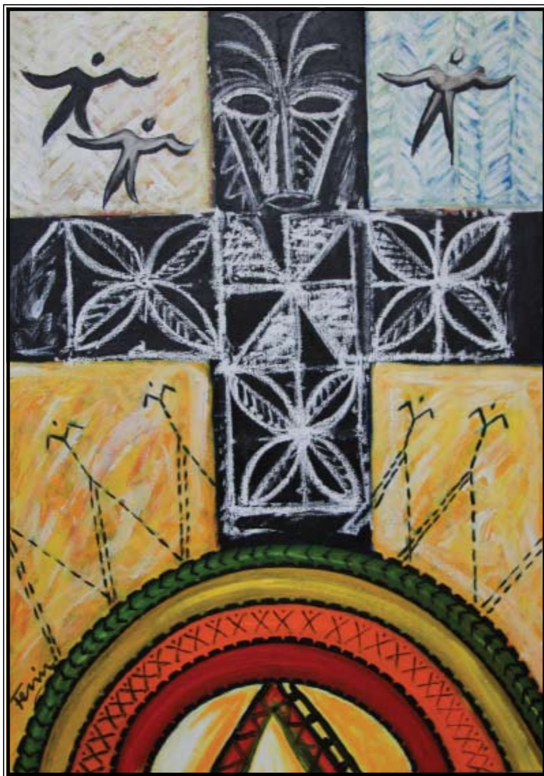
Nuanua folau - (Sailing Rainbow) , 2010, the rainbow imagery is a positive symbol of hope and action. © Fatu Feu'u