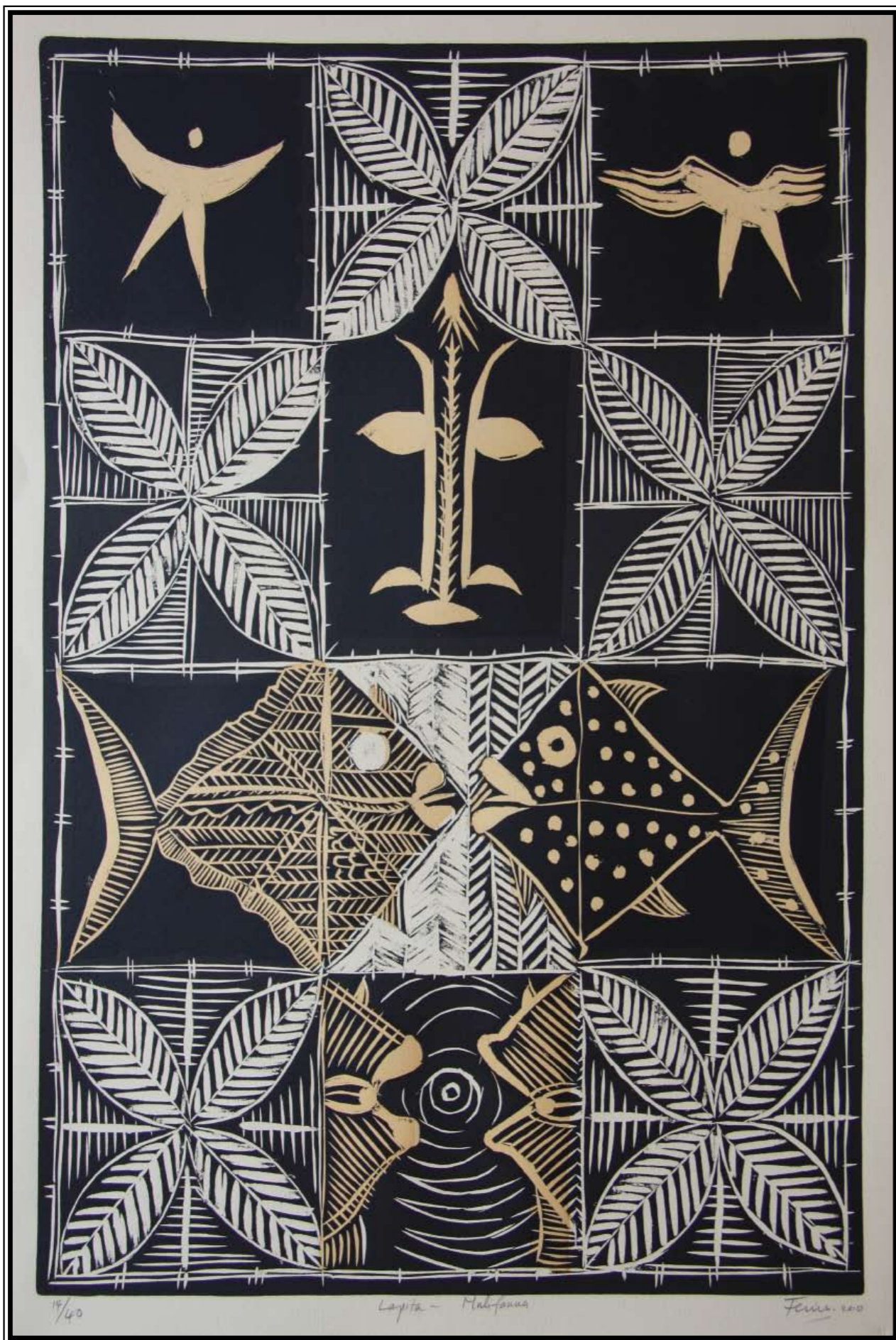
Lapita Mulifauna, Woodcut on paper Ed 40, 2010 - inspired by Lapita pottery. © Fatu Feu'u