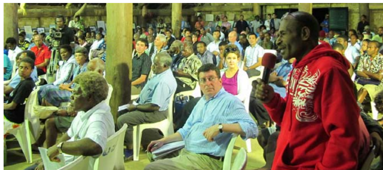
Vanuatu's place in the Pacific and the World - a public discussion forum facilitated by PiPP and broadcast live to radio and TV.